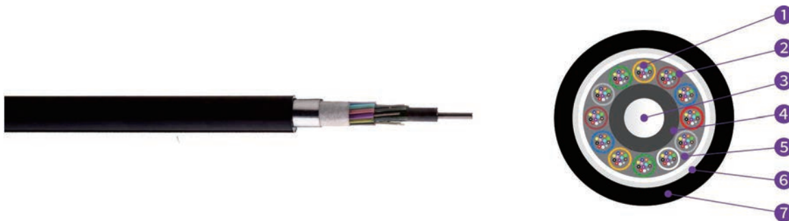
1. Fibers, 2. Loose Tube with Gel, 3. CSM, 4. PE Layer, 5. Compound, 6. Aluminum Tape, 7. PE Outer sheath