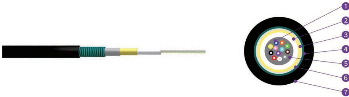
1, Fibers 2, Loose Tube 3, Aramid Yarns 4, PSP 5, Tube Filling Compound 6, Water-Blocking Tape 7, PE sheath